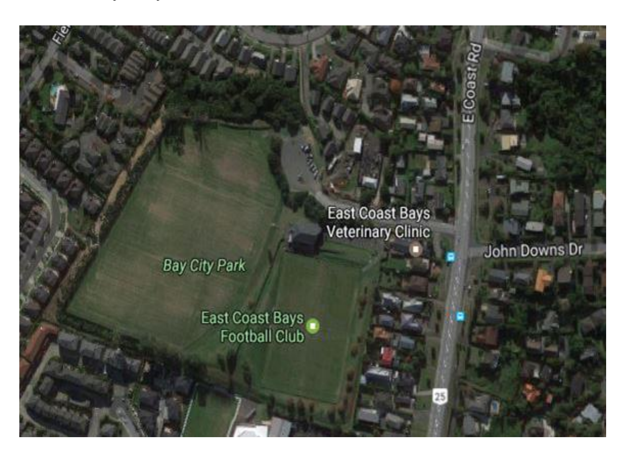
Bay City Park, 50 - 54 Andersons Road, Oteha